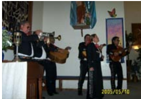
Mariachis bands are an important part of Hispanic culture.

We do ministry to Hispanic immigrants from Mexico and other Latin American countries. Many of our priests are bilingual and many of our new vocations are originally from Mexico or other Hispanic countries. As with the Native Americans, the richness of customs, traditions, faith and family values of the Hispanic culture is a great gift which they bring to us.