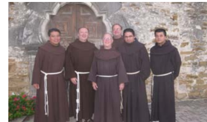
Some of our seminarians with their directors

We have been blessed with 10 young men seeking to be Franciscans. This is a wonderful blessing, but it is also a burden. The yearly cost to house and educate just one young man in training is about $30,000.