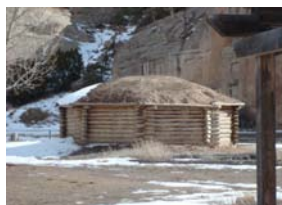
The 6 or 8 sided log Hogan is the traditional Navajo Home & place of their ceremonies..