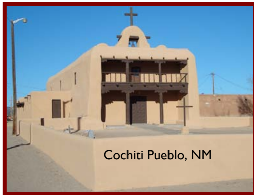
Cochiti Pueblo, NM

Navajo Indians Pueblos Indians Hispanics