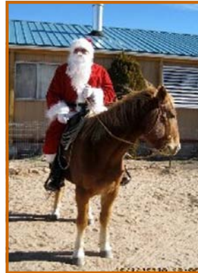
Santa Claus comes a little differently on the Navajo reservation.

The distances on the Navajo reservation are vast, about 500 miles by 300 miles. The Navajo people live widely scattered through this vast desert land. So, for example, one missionary sometimes travels 215 miles to say just three Masses at several small chapels.